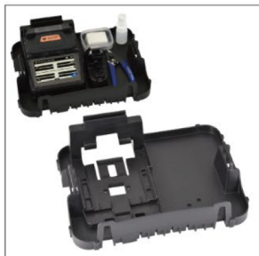
Working tray WT-18