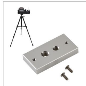
Tripod adapter TA-18