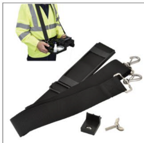
Working tray strap kit WSK-18