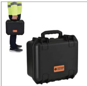
Carrying case CC-18