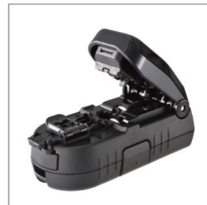
Handheld fibre cleaver FC-7LS